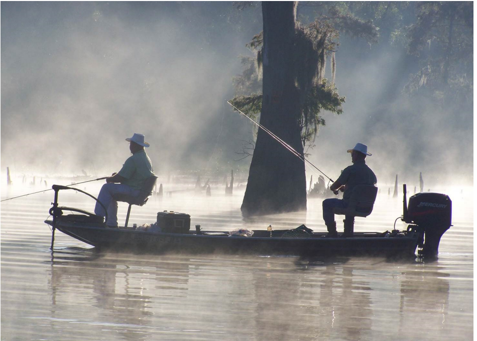
A tranquil morning in the Atchafalaya Basin.

Please support businesses that care about Louisiana and their communities and are committed to making our world a better place, like Lamar Advertising and the other ABK Business Sponsors listed later in this report.