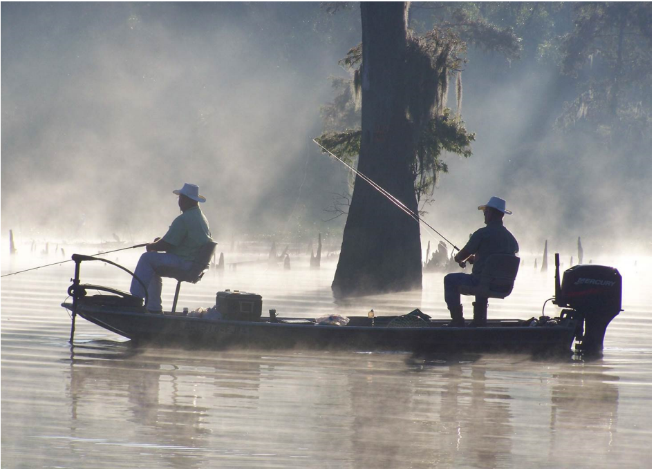
A tranquil morning in the Atchafalaya Basin.

Please support businesses that care about Louisiana and their communities and are committed to making our world a better place, like Lamar Advertising and the other ABK Business Sponsors listed later in this report.