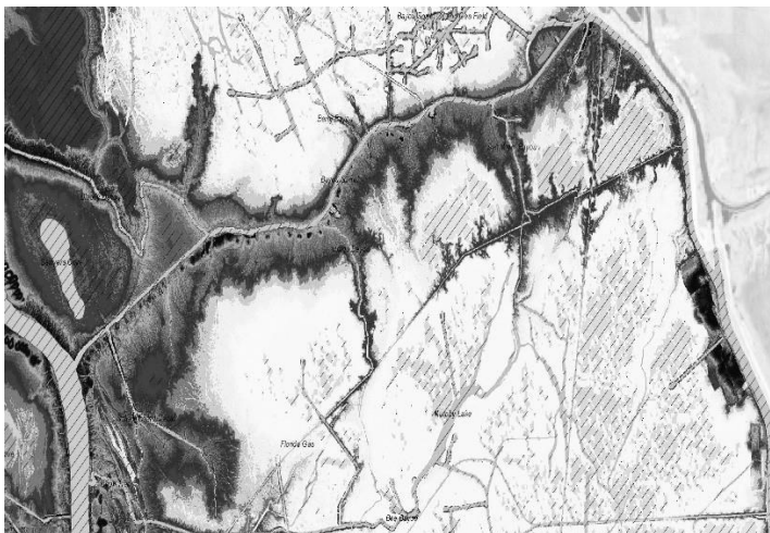
Occurring accretion in the East Grand Lake Area. Notice the deltas forming from pipeline canals at each cut into the swamps.

Today, the Nature Conservancy (TNC), with funds from Shell Oil and undisclosed "others", is working to revive LDNR's East Grand Lake (EGL) project. The pertinent facts about the project are as follows: