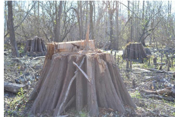
This image shows the result of logging operations by one of the landowners Photo taken in the Fall 2016. This is the “landowner vision for the Atchafalaya Basin.”

There are three main landowners that will benefit by creating uplands out of these swamps. One of them, A. Wilbert’s Sons, has already harvested and destroyed hundreds of acres of cypress swamps in the Basin. The second main landowner was logging cypress swamps just last fall, and the third landowner stated that they want the accretion so “they can manage their timber.”